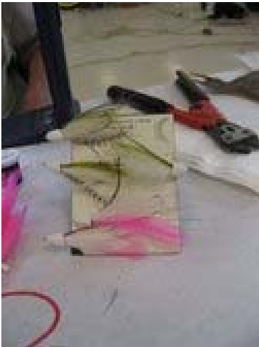
Samples of the Miyawaki Beach Popper tied by Leland himself.