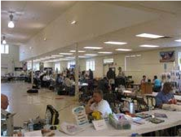
General area shot showing the set up for demo's