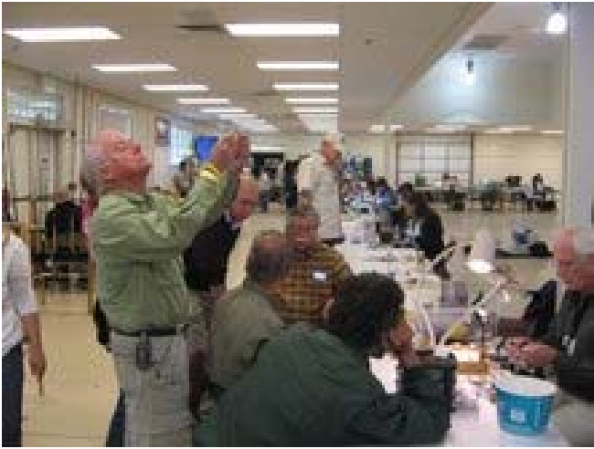
Most of our 'gang' collected at a tyer's station