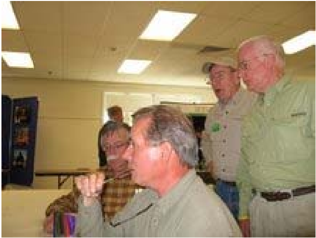
Looks like a fun and educational time was had by all.