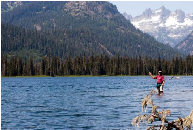
Tucquala Lake by Salmon la Sac

I would like to include in the news letter a feature called Picture Of The Month but it will take you to send them in. So keep that in mind when you are out and about. Thanks