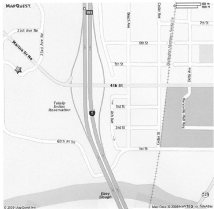
Map of Best Western Tulalip Inn, 3228 Marine Dr Ne Marysville

Marysville Exit 199, then West on Marine Drive/4th Ave; then South/Left on 33rd Ave NE to Best Western.