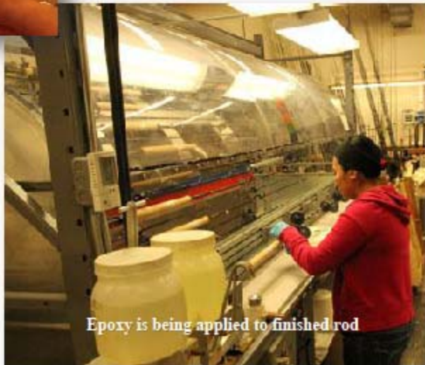
Epoxy is being applied to finished rod

Each step involved someone ensuring quality control of all